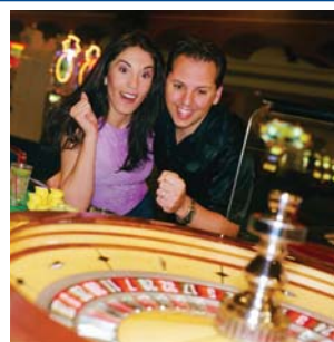
One of UFCW Michigan's most popular events, a day a Battle Creek's FireKeepers Casino, is back for 2012!

The Local also plans to conduct additional trainings to supplement the quarterly sessions with more in-depth training on a variety of issues including: Organizing, Health and Safety, Women's Leadership and Community and Labor Advocacy.