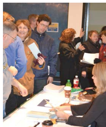
Lansing area Kroger members prepare to cast their vote on the new contract.

In late December, UFCW 951 members working at Kroger turned out in large numbers to ratify a new three-year contract by a vote of 84 percent "yes" to 16 percent "no."