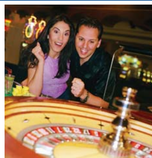
One of UFCW Michigan's most popular events, a day a Battle Creek's FireKeepers Casino, is back for 2012!

The Local also plans to conduct additional trainings to supplement the quarterly sessions with more in-depth training on a variety of issues including: Organizing, Health and Safety, Women's Leadership and Community and Labor Advocacy.